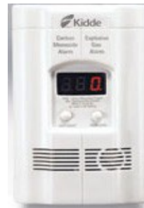
KN-COEG-3 Multi-Gas 5 Year Limited Warranty

A CO alarm that has a digital display and contains a lifetime battery. This alarm has a 10 Year Limited Warranty. It has an AC adapter built in which can be removed to enhance the installation properties. These retail in the $36 to $45 range at popular retail outlets.